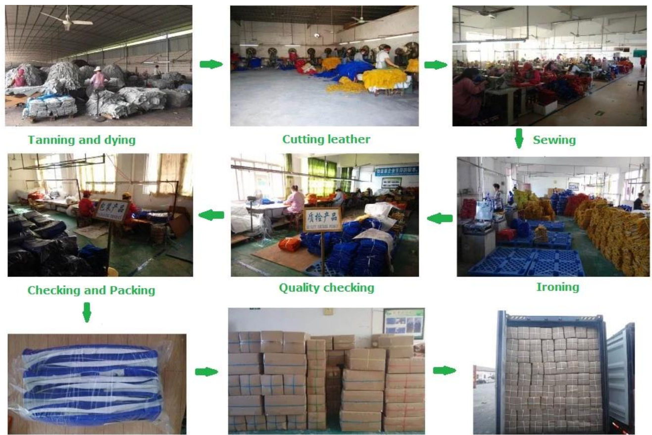
Pack into polybag