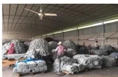
Tanning and dyeing