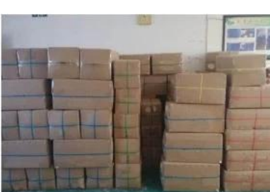
Pack into carton