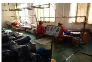
Checking and Packing