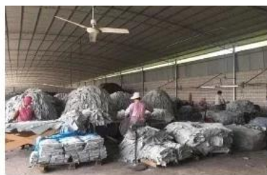
Tanning and dyeing