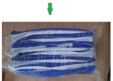
Pack into polybag