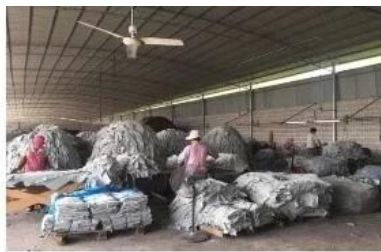
Tanning and dyeing