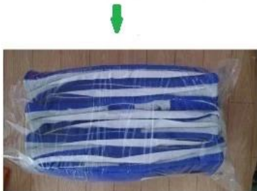
Pack into polybag