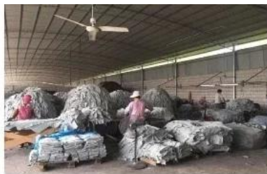
Tanning and dyeing