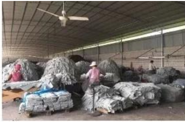
Tanning and dyeing