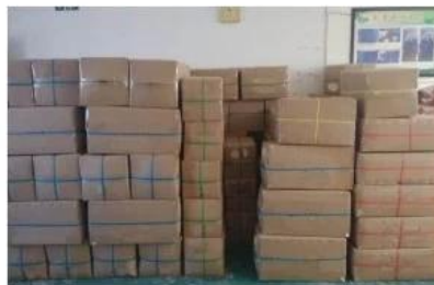
Pack into carton