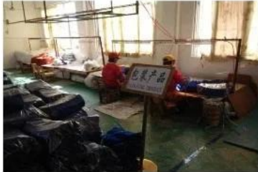
Checking and Packing