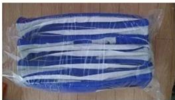
Pack into polybag