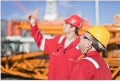
OIL FIELD & MINING