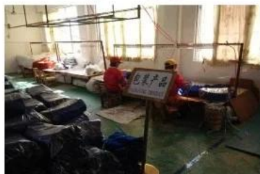
Checking and Packing