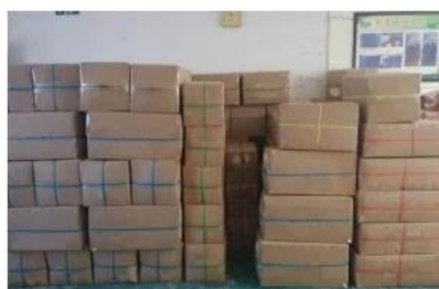
Pack into carton