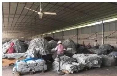
Tanning and dyeing