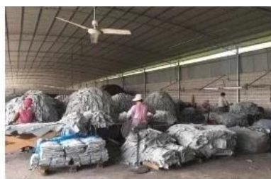
Tanning and dyeing