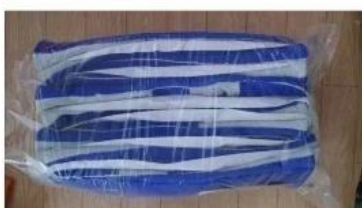
Pack into polybag