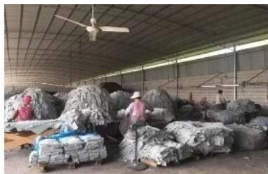
Tanning and dyeing