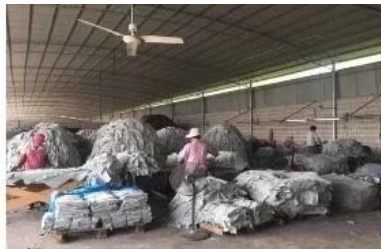
Tanning and dyeing