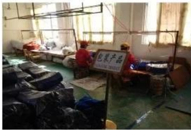
Checking and Packing