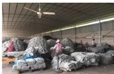
Tanning and dyeing