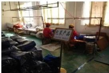
Checking and Packing