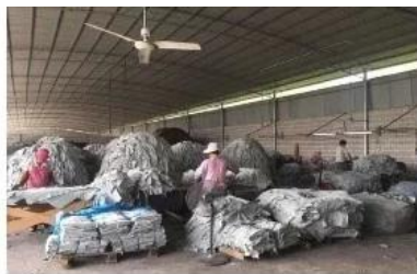
Tanning and dyeing